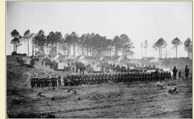
SOLDIERS IN CAMP

General George Thomas reported "Headquarters of the corps still at Brown's Spring on September 7th." While the army was camped around Brown's Spring they captured a number of Confederate soldiers who had been attempting to visit their families in the area. These were men who had been paroled after they were captured at Vicksburg. They had thought it possible to make a visit home before rejoining their commands, not knowing that Dade County had also been occupied. Several