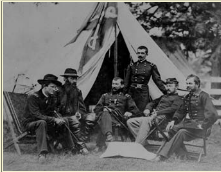
GENERAL PHILIP SHERIDAN AND STAFF

Brown's Spring, located at the base of Sand Mountain, was a major landmark used by the Federal Army in the occupation of Dade County in September 1863. One of the logistical problems of